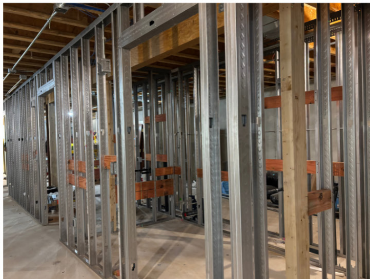
Metal framing for bathrooms on the lower level.