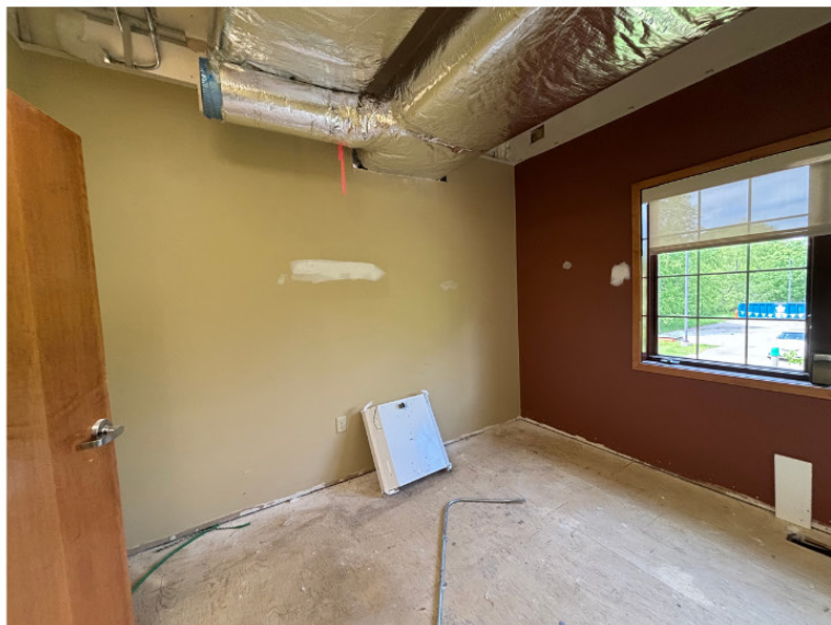
Duct work in an office on the main level.

Construction is picking up at the new administration building! Crews are currently installing metal support beams for the additional walls in the lower level/community space and installing improved duct and electrical work throughout the building. We are so excited to centralize our administration team for easier community access.