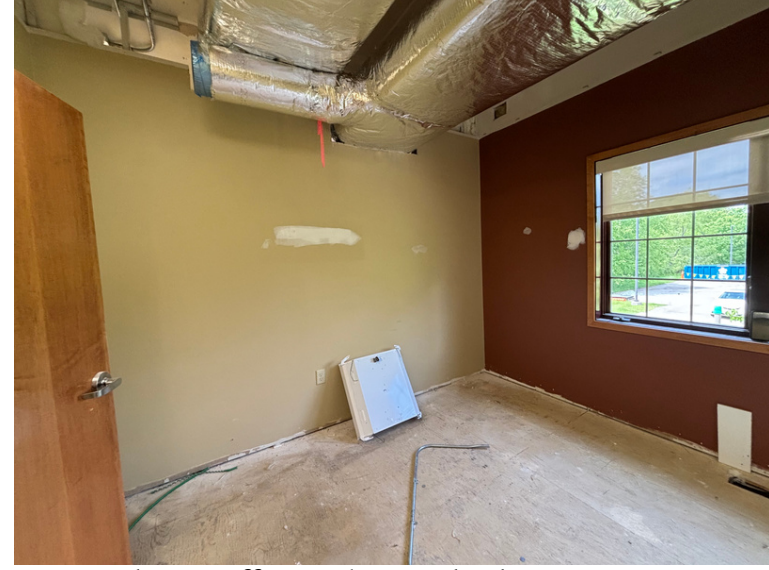
Duct work in an office on the main level.

Construction is picking up at the new administration building! Crews are currently installing metal support beams for the additional walls in the lower level/community space and installing improved duct and electrical work throughout the building. We are so excited to centralize our administration team for easier community access.